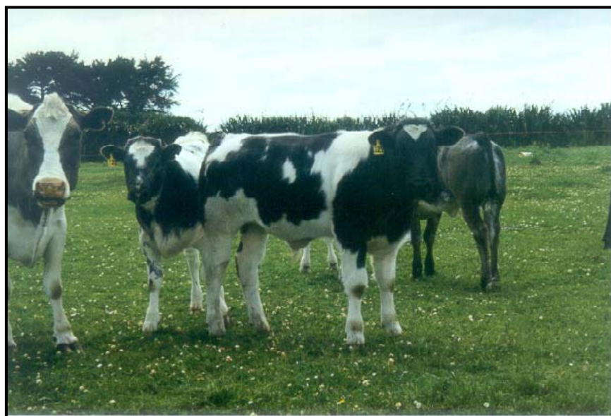
[ BBB X Holstein Friesian ]