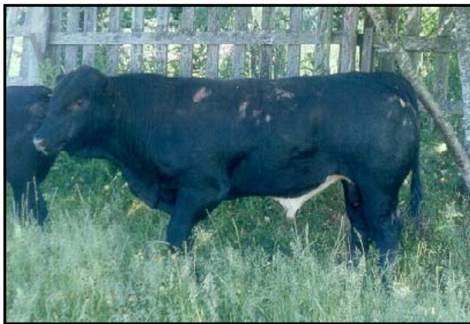
[ BB X Angus ]