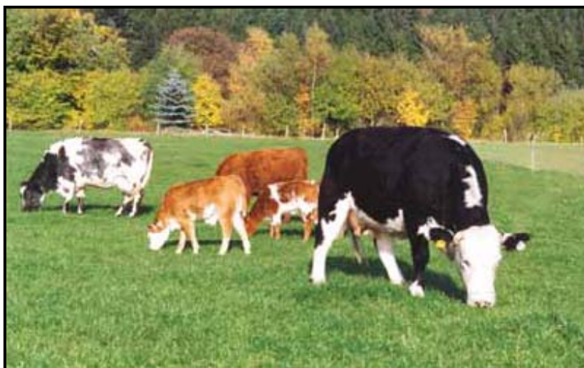
[ BBB X [ jersey X Hereford]]

The BB genetics is largely used on Danish dairy herds. In 2005, 7172 cows were inseminated with BB semen, which represents 19 % of all beef breed inseminations in Denmark.