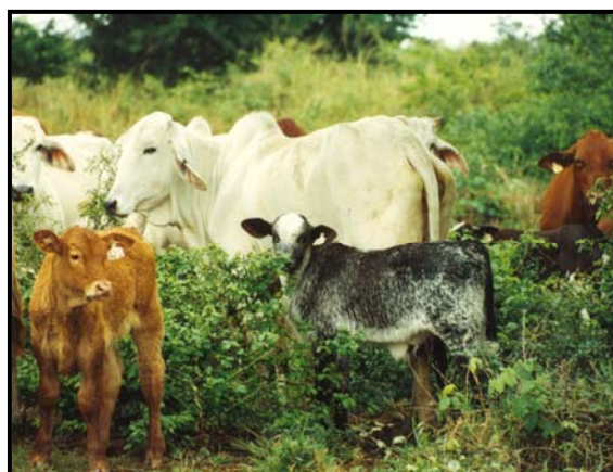
[ BB X Nelore ]

Seeing a very higher killing-out percentage for the [Nelore X BB] crossbred, by comparison with the Braford, it goes without saying that the BB joins in the increasing of the meat production in Brazil.