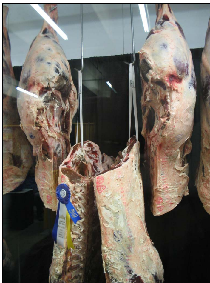
BB winner carcass: REGINA 2005

The double distinction, acquired in 2004 at the CANADIAN WESTERN AGRIBITION, one of the most important agricultural event of the North of America, has allowed to our breed to experience a revival of interest in Canada and everywhere in the world because it has stopped the 28 years domination of the Limousin breed.