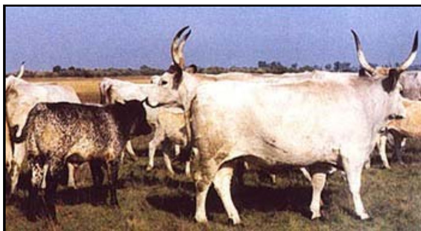
[BBB X Hungarian grey]

A third experimentation was related to the crossing with the Simmental. It appeared that, for a similar live weight, the carcass weight of the crossbred [BBB X Simmental] was by 23.4 kg (+6.6 %) more than the Simmental. The Killing out percentage was respectively for the crossbred and the purebred of 61.4 % and of 57.7%. Slaughter value of the crossbred was markedly and significantly higher than the purebred Simmental.