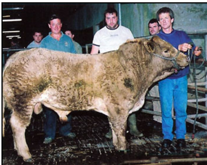
[BBB X Charolais]

Our Progeny-test is then an effective tool, able to ensure the promotion of our sires in crossing.