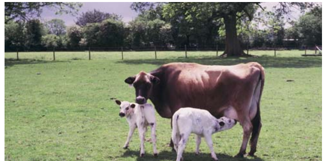
[ BBB X Jersey ]

His point of view was changed, due to the financial results of the BB.