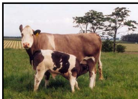
[BB X (crossbred Hereford)]