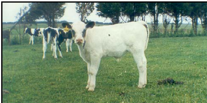
[ BBB X Holstein Friesian ]